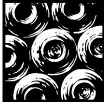
"Fill the jars with water."

John tells us that this sign of Jesus' power took place at the beginning of His ministry at a wedding feast at Cana. Jesus' ministry --- from the very start --- occurred in real life, addressing real-life concerns. And He continues to enter our real lives as He offers Himself to us in so many ways, especially in the bread and wine of the Eucharist. He generously provides what we need to exercise our own gifts for others.